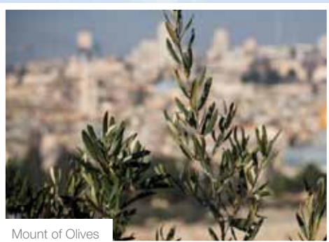
Mount of Olives

With St George's all your needs will be taken care of as you visit the holy places, meet the people of the land and study the Bible in a new context. Situated in the grounds of the Anglican Episcopal Cathedral,