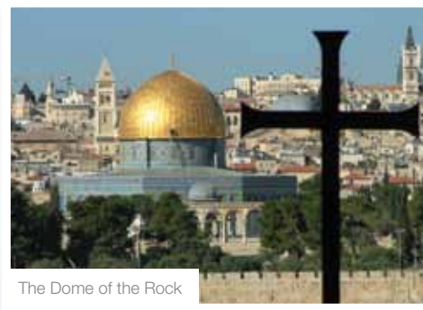
The Dome of the Rock